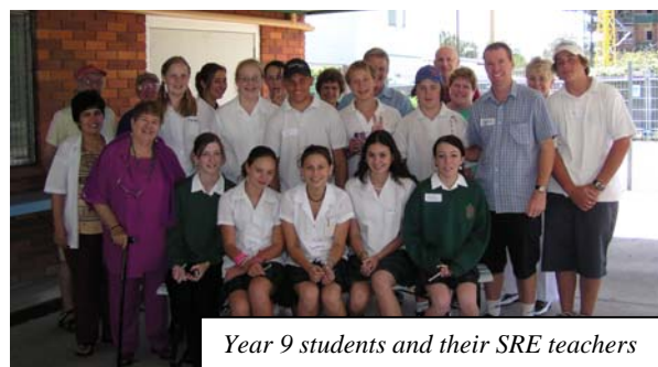
Year 9 students and their SRE teachers

Having completed this task, several students were asked to do the readings during the service in the church. It was done with enthusiasm and the proper reverence by each one of them and