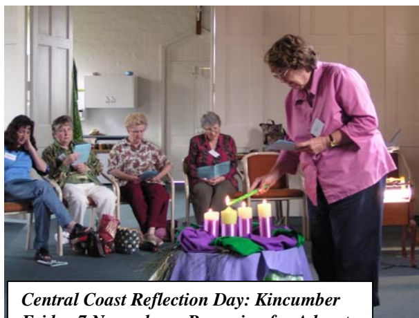
Central Coast Reflection Day: Kincumber Friday 7 November – Preparing for Advent