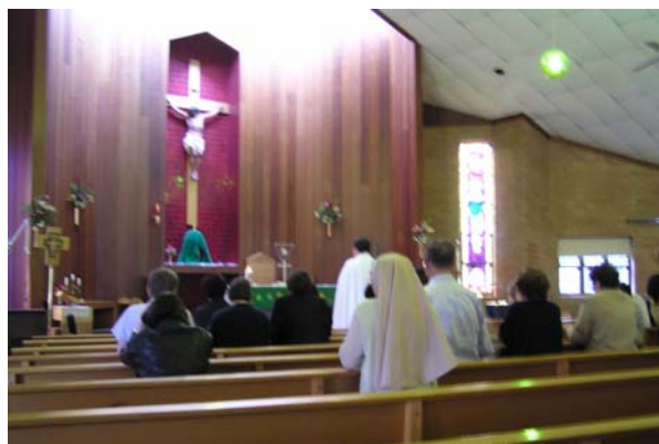
Northern Region Reflection Day: Normanhurst Friday 31 October – Preparing for Advent