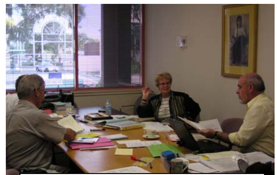
CCD Executive Members at a Planning Meeting for 2004

Do you have something to share of your experience as a catechist? One or two lines.... a good lesson....a story....a great resource. ...some special event at your parish or school? Send it to: The Editor, Connections, CCD, PO Box 125, Wahroonga 2076 or E-mail: amwhenman@brokenbay.catholic.org.au Deadline : Monday 22 March 2004