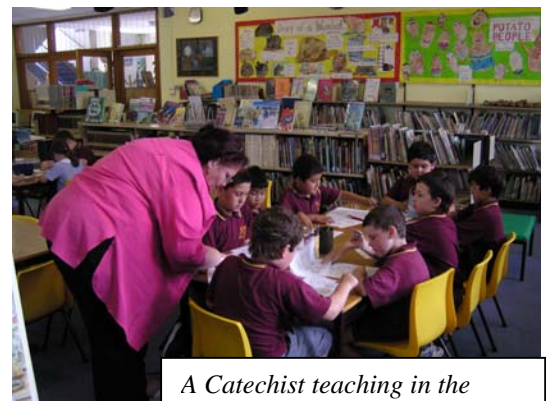
A Catechist teaching in the Manly Warringah Region