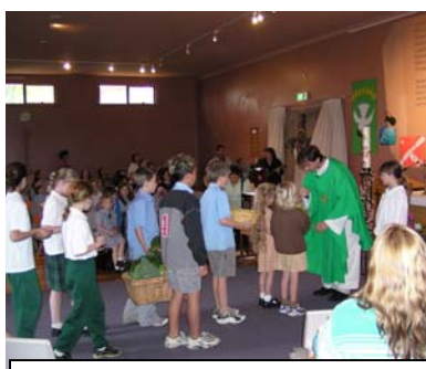
Presentation of the Gifts along with produce from the farms in the area.