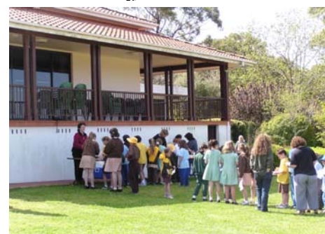
Afternoon tea in the grounds of the St Francis Assisi Centre