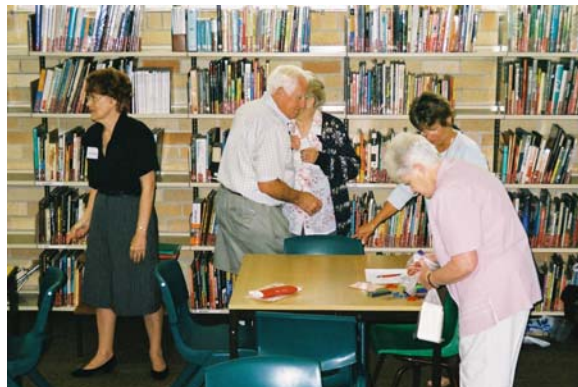
Members of the Terrigal Secondary Team setting up for a Year 9 class on The Nature of Church .