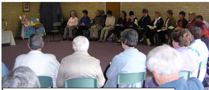
Manly Warringah Reflection Day: Forestville Monday 3 November -Christ our Light – The Gift of Faith

Over 80 catechists and friends attended CCD Reflection Days held in Term 4, 2003.