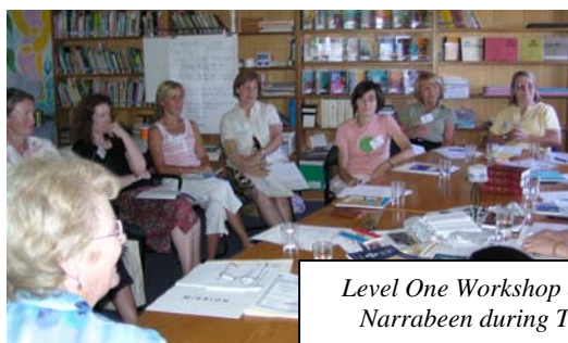
Level One Workshop at CCD Narrabeen during Term 1