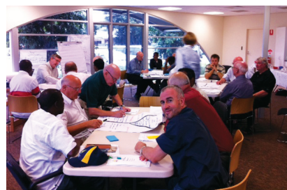
Tuggerah Lakes and Brisbane Waters Clergy Deanery Meeting at Woy Woy

The Clergy reflected on a series of questions from a parish and Diocesan perspective. The feedback from these meetings will be put forward to the First Synod Gathering in June.